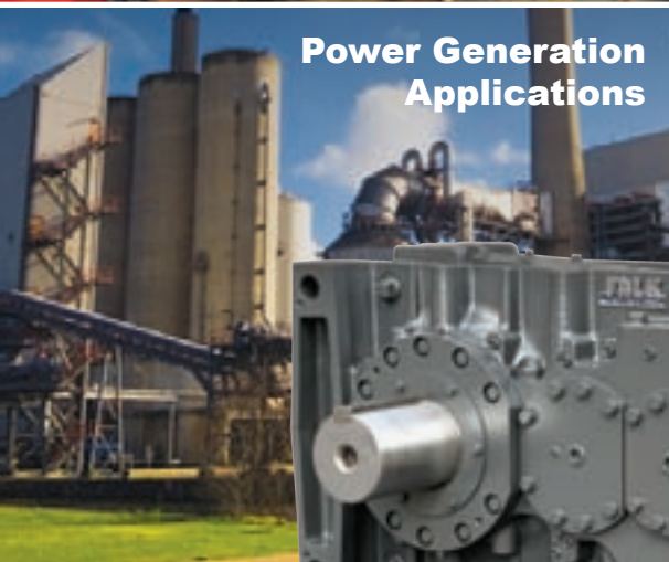
Power Generation Applications