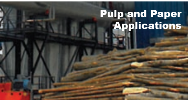
Pulp and Paper Applications