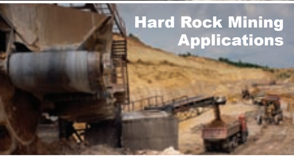
Hard Rock Mining Applications