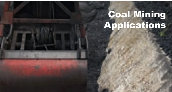
Coal Mining Applications