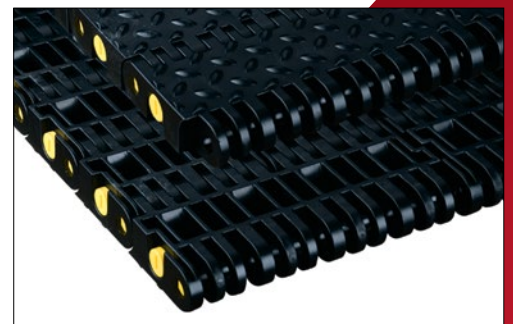
3129 Series SafetyTop Chain