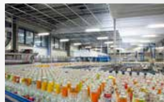
Returnable filling line