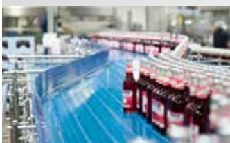
One-way filling line