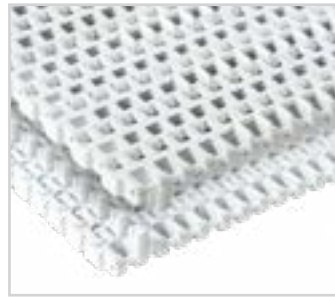
1255 SuperGrip KleanTop