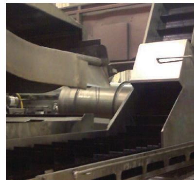
The Rexnord MatTop FTR R8506 Chain handles temperatures up to 325 F.