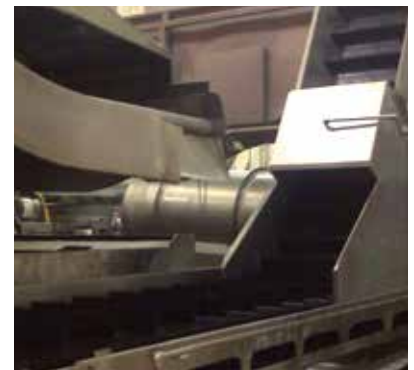
The Rexnord MatTop FTR R8506 Chain handles temperatures up to 325 F.