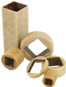
Square bore configurations