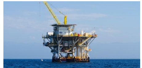
Oil rig platform equipment