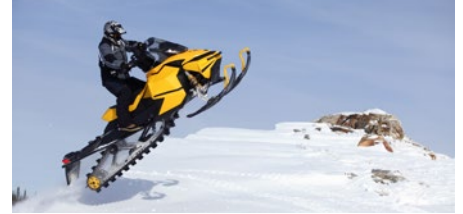
Recreational vehicle clutches