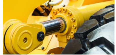
Heavy equipment hydraulic cylinder pivots