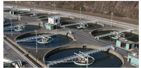
Water management systems and valves