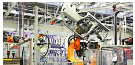
Factory-automated production line equipment