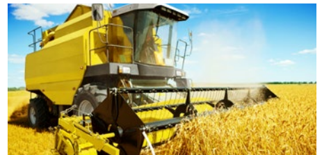
Agricultural harvesting equipment