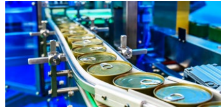
Food packaging equipment