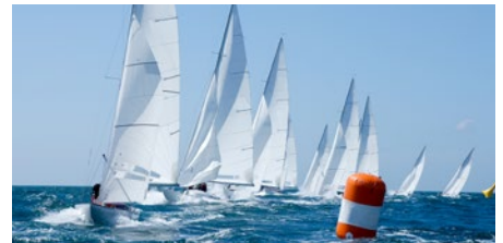
Sailboat hardware and marine steering - engine tilt drives