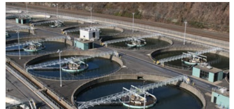
Water management and valves