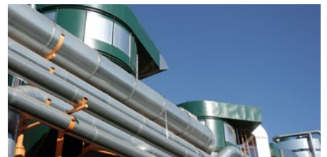
Wood processing equipment