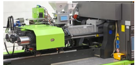
Injection molding equipment